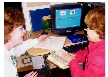
One-to-One tutoring at Riverchase ESL Learning Center Birmingham, AL

They report that 71% of their students greatly improved their reading levels, and approximately 65% improved in other academics and school attendance because of Project Light Software and one-to-one tutoring--and at the same time they are reading using The Christian Literacy Series: The Light is Coming Bible-based materials. They are also preparing to open an additional Learning Center this Fall in partnership with Northside Outreach Center to help adults coming out of prison and children of disadvantaged families.