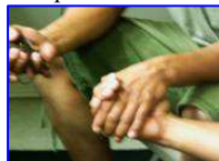
Prayer in a Project Light Learning Center Ocean View Baptist, Norfolk, VA

Project Light also provided numerous upgrades and expansions to existing Learning Centers.